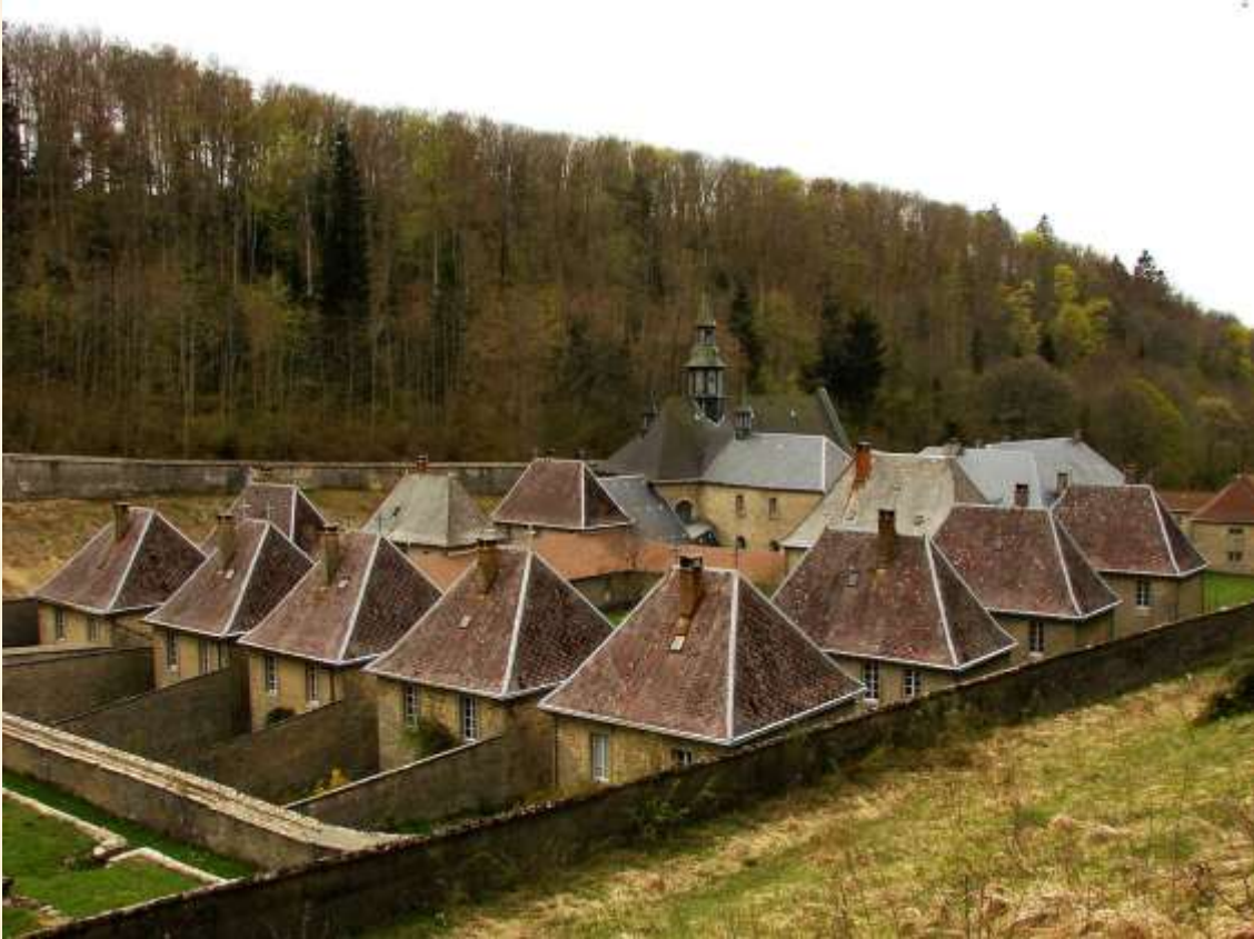
La Chartreuse de Portes